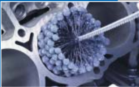
Surface finish of a cylinder bore...